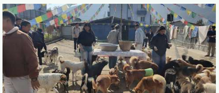
Community service day