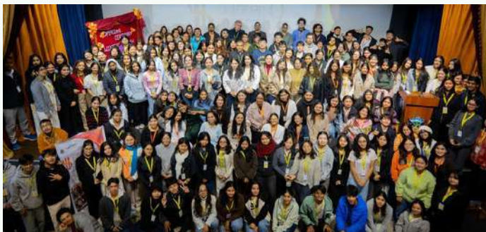
Winter Warmth Stage Presentation