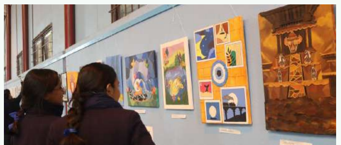
Joint School Art Exhibition