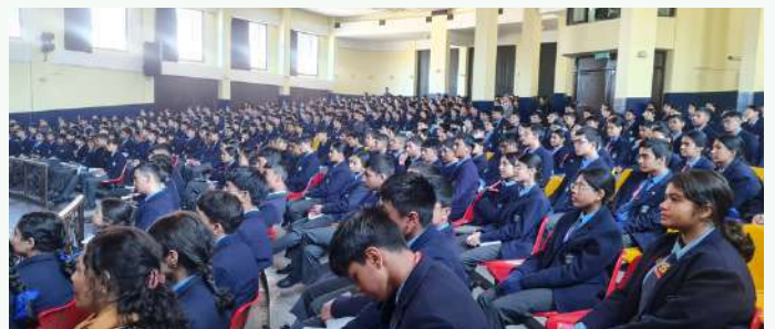
Motivational Talk Programme