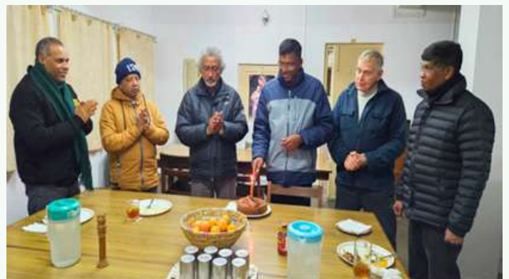
NJSI activities in villages, and birthday celebrations