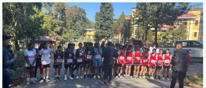
Cross Country Race at KUHS