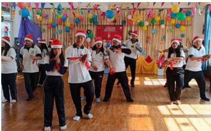
Christmas at SBK